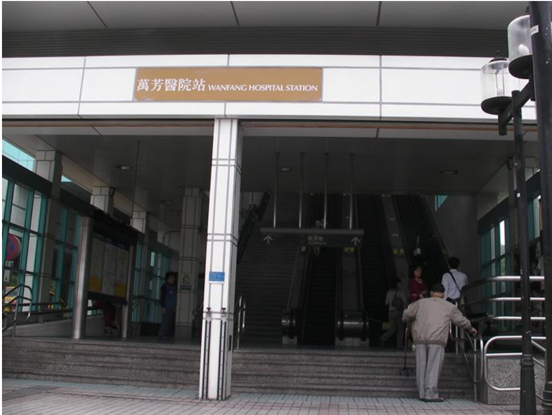
Wanfang Hospital MRT where you exit to get the 530 bus 萬芳醫院站，可以從這站轉乘 530 巴士。