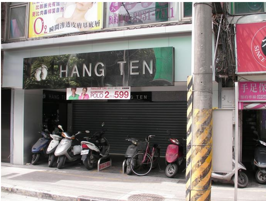
Number 530 Bus stop outside Hang Ten by Wanfang Hospital MRT station. 於萬芳醫院捷運站附近 Hang Ten 的 530 巴士站。