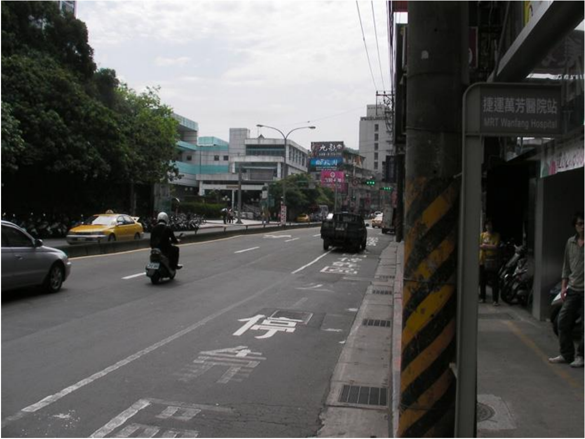
Bus stop outside MRT Wanfang Hospital station 於萬芳醫院捷運站外的巴士站。