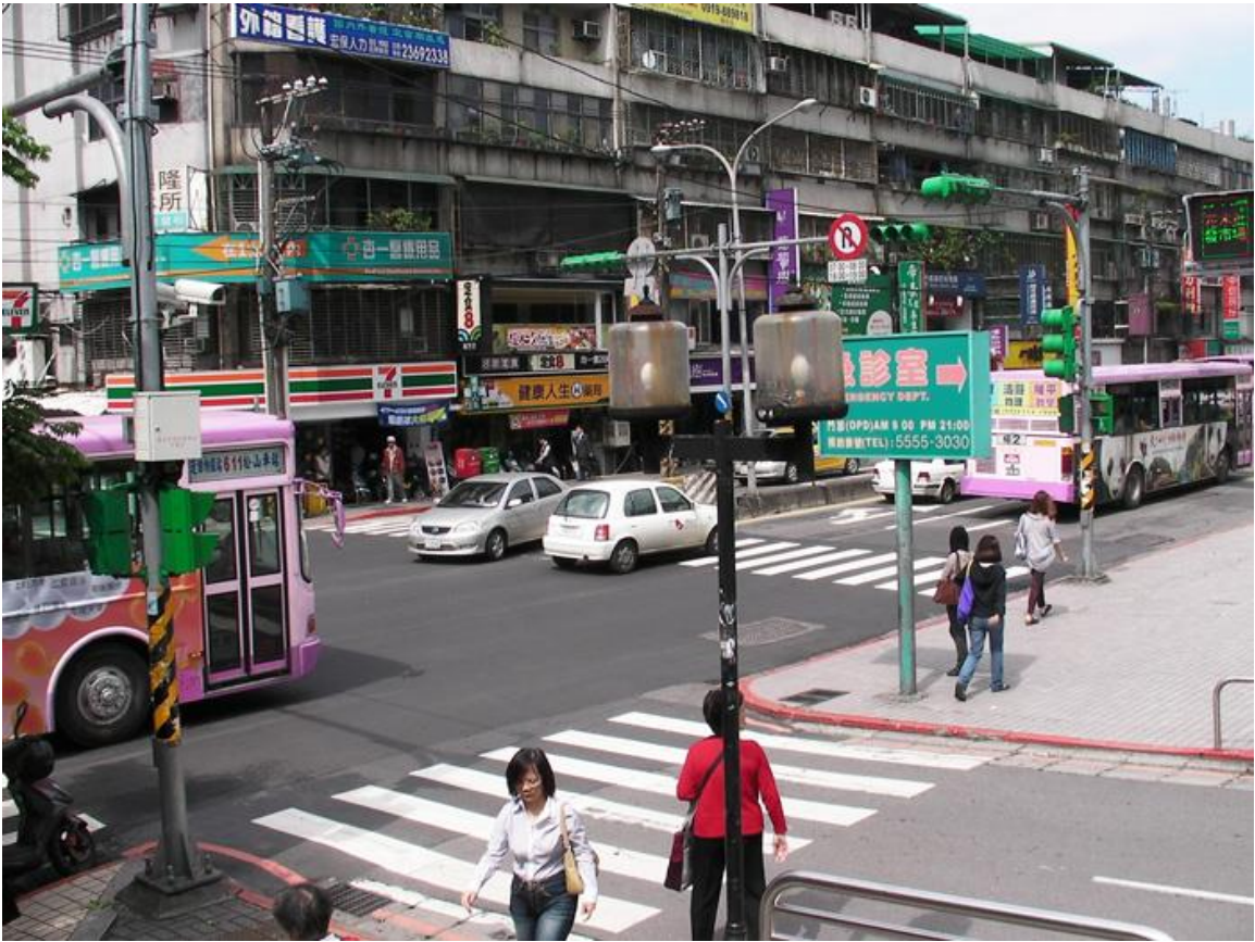
View from Wanfang Hospital exit 從萬芳醫院站出口望出去